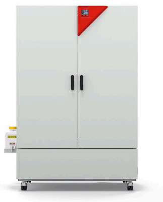
Model KBF-S ECO 720