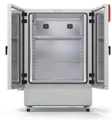
Model KBF-S ECO 720